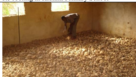
Cementing the classroom