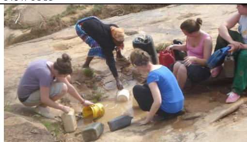
Work-camp collecting water