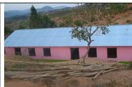
Repaired classroom in Kiukini