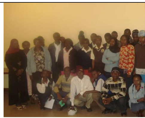
August 2009 Student Meeting Nairobi