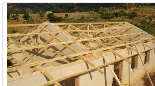
Re-roofing in Kiukini Primary School