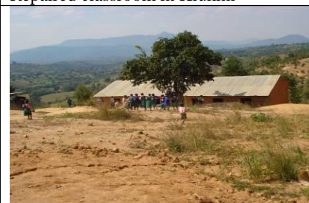
The View from Kiukini