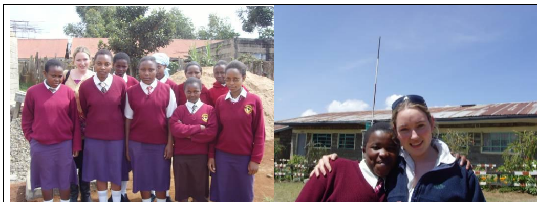
June 2008 Sponsored student in Bongo and Gakoe Secondary School