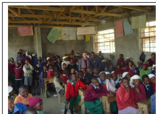
A class of Mugiko Primary school